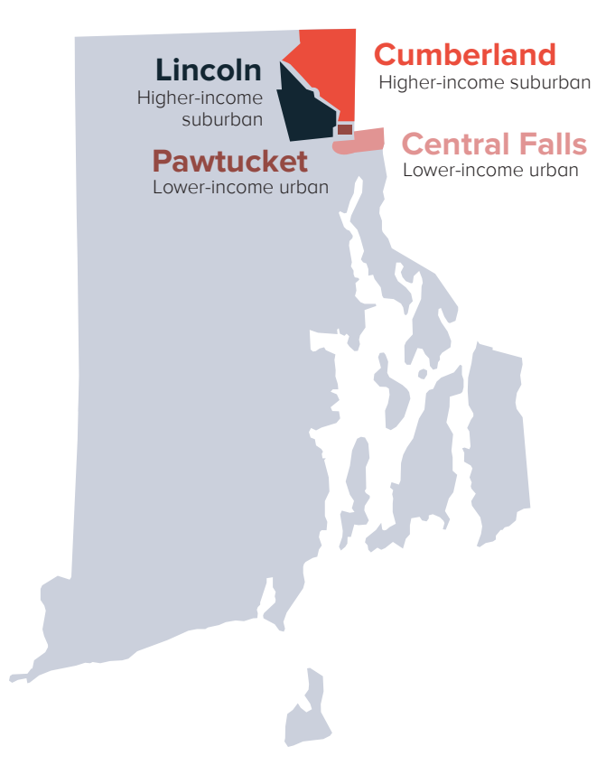
FIGURE 2 THE FOUR RHODE ISLAND COMMUNITIES SERVED BY BLACKSTONE VALLEY PREP MAYORAL ACADEMY

three middle schools, and one high school—meaning that roughly 10 percent of students from across all four school districts will be enrolled at BVP.<sup>27</sup> At that size, BVP will also serve roughly the same number of students as some of the currently existing inter-district integration plans elsewhere in the country.