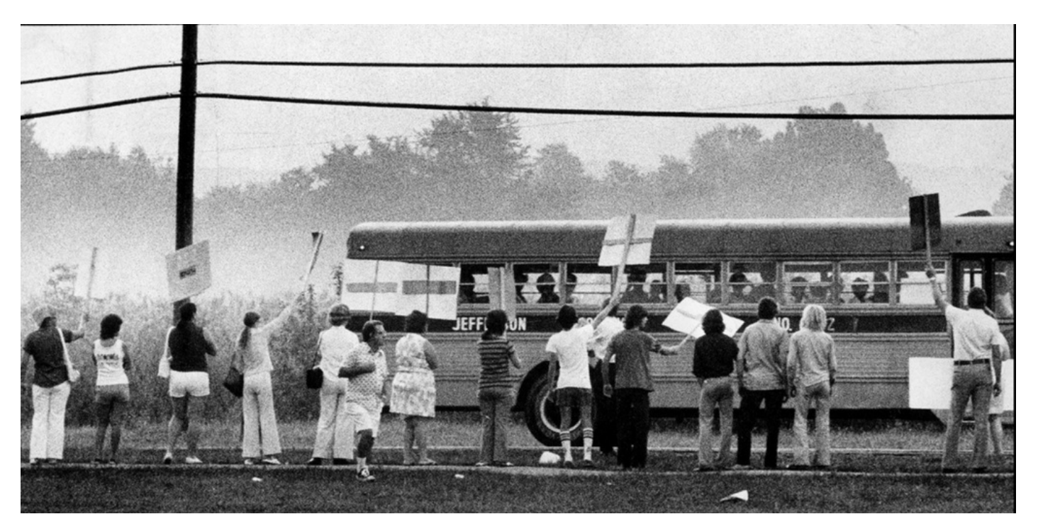
DEMONSTRATORS WAVED SIGNS ALONG FAIRDALE ROAD AS ONE BUSED TO FAIRDALE HIGH SCHOOL NEARED ITS DESTINATION.

At least a portion of the school system's success is rooted in Louisville and Jefferson County's commitment to implement its integration program county-wide and across the region. To maximize the access to and effectiveness of desegregation plans, bigger is better; that is to say, plans that reach every corner of a region not only involve a more economically diverse group of children, but also minimize the likelihood that wealthy parents can avoid desegregation by simply switching neighborhoods. While Jefferson County Public Schools accomplished this by consolidating city and county districts, multiple districts have recognized that interdistrict programs can be powerful tools for equity even when a merger is not politically plausible. We discuss the importance of these programs later in this section.