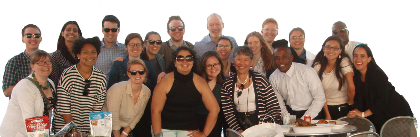
TCF's Class of 2017, Alumni and Staff