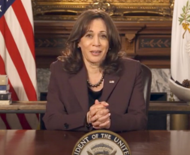
VICE PRESIDENT KAMALA HARRIS, SPEAKING AT AN APRIL 2022 TCF EVENT

“Thank you to [TCF] for bringing together this extraordinary group of leaders... and to The Century Foundation... for your unwavering partnership and tireless advocacy.”