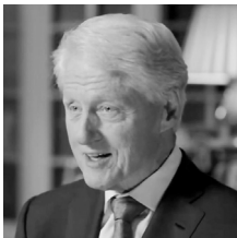
FORMER PRESIDENT BILL CLINTON

INCLUSIVE MANUFACTURING | While some wrote off American manufacturing as a relic of the past, TCF has never given up fighting for quality, high-paying manufacturing jobs, particularly for communities of color. That work paid off this year in an historic $200 billion reinvestment in U.S. industrial policy, through legislation that included many of TCF's priorities. Also this year, we convened twelve community colleges alongside leading workforce development groups, creating a nationwide model for how to advance a stronger, more equitable manufacturing sector.