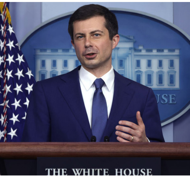
U.S. SECRETARY OF TRANSPORTATION PETE BUTTIGIEG, SPEAKING AT AN OCTOBER 2022 TCF EVENT

“The commitment by the Urban Manufacturing Alliance and The Century Foundation, by partnering with community colleges across the country, is helping widen the circle of opportunity and increase racial equity in the manufacturing sector.”