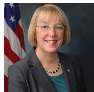
U.S. SENATOR PATTY MURRAY

CHILD CARE | In 2023, TCF transformed the conversation around child care in the United States—putting the care affordability crisis at the center of national debate. Our June report, which sounded the alarm on the impending “child care cliff,” resulted in around-the-clock media coverage for TCF experts, from CBS and NBC Nightly News appearances to the New York Times and NPR . Working closely with allies on Capitol Hill, our research and advocacy spurred the introduction of federal legislation and was even cited during a GOP Presidential Debate—a testament to the growing, bipartisan momentum to finally address the nation’s care crisis.