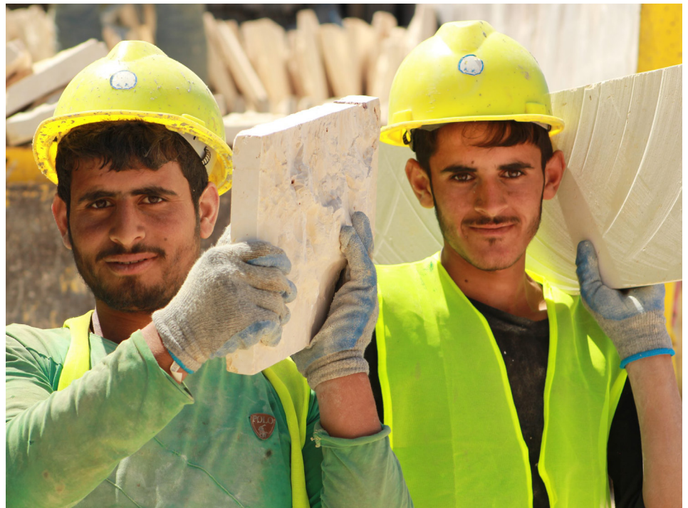
Photo right: Laborers work on building a water reservoir to serve the town of Hamanna to the east of Beirut in Lebanon, under the Employment Intensive Infrastructure Programme in Lebanon, in a 2018 photo.

Photo top: Palestinian emergency services and local citizens search for victims in buildings destroyed during Israeli air raids in the southern Gaza Strip on November 18, 2023 in Khan Yunis.